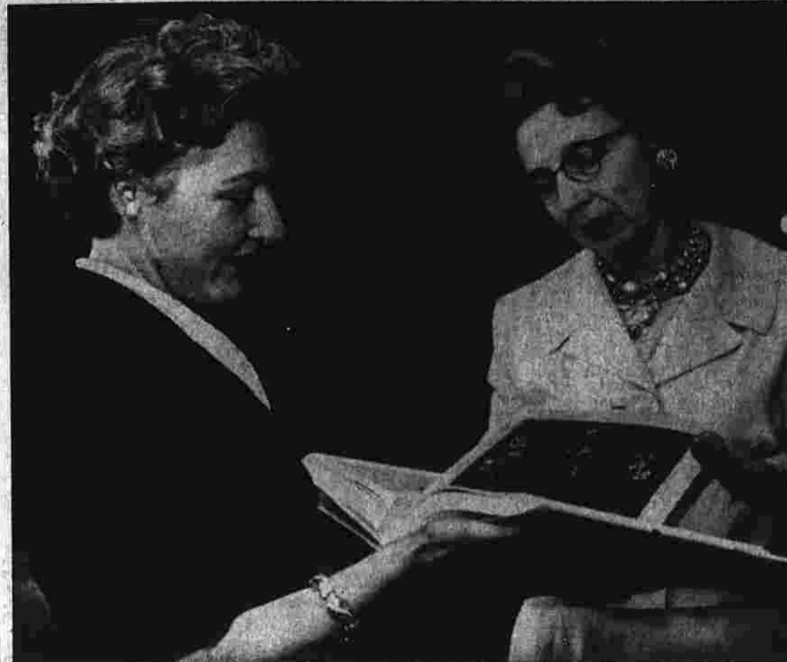
Lutz Junior Museum Honors Volunteer of Year

REGAL MEN'S SHOP 908 MAIN STREET MI 3-2478