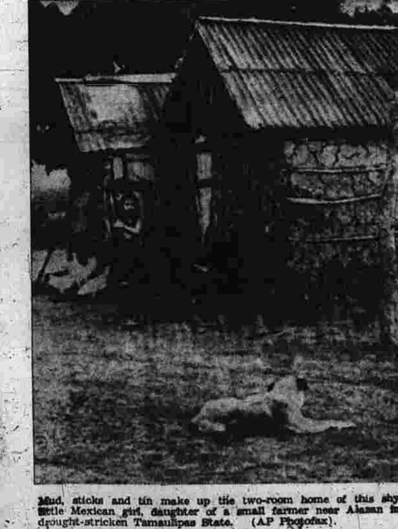
Mad, sticks and tin make up the two-room home of this shy little Mexican girl, daughter of a small farmer near Alazan in drought-stricken Tamaulipas State.